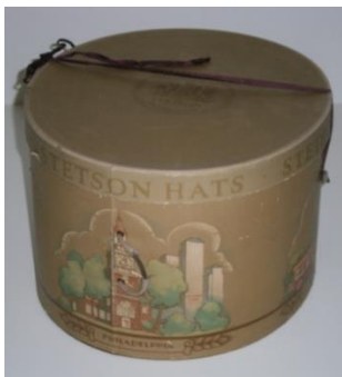
Man's tan cardboard hatbox , mid-20 th century "Stetson Hats" Gift of the Drama Department Costume Shop, Dartmouth College

Reason: Space limitations in the costume collection.