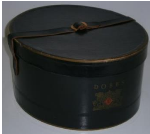
Man's black cardboard hatbox with black leather straps , mid-20 th century "Dobbs" Gift of the Drama Department Costume Shop, Dartmouth College

Reason: Space limitations in the costume collection.