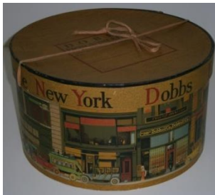
Woman's gold round cardboard with twill tape ties , mid-20 th century "Dobbs Fifth Avenue" Gift of the Drama Department Costume Shop, Dartmouth College

Reason: Space limitations in the costume collection.