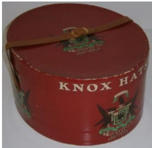
Man's red oval cardboard hatbox with leather straps , mid-20 th century "Knox Hats" Gift of the Drama Department Costume Shop, Dartmouth College

Reason: Space limitations in the costume collection.