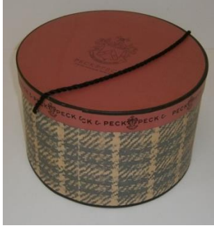
Woman's grey & red cardboard hatbox , mid-20 th century "Peck & Peck" Gift of the Drama Department Costume Shop, Dartmouth College

Reason: Space limitations in the costume collection.