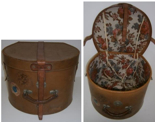
Woman's large leather hatbox with straps and floral cotton lining , early 20 th century Initials: M. B. W. Gift of the Drama Department Costume Shop, Dartmouth College

Reason: Space limitations in the costume collection.