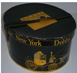
Man's black cardboard hatbox with gold decoration , mid-20 th century "Dobbs Fifth Avenue" Gift of the Drama Department Costume Shop, Dartmouth College

Reason: Space limitations in the costume collection.