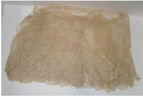
Paris, France Two Pieces of Ivory Lace, 1920 Gift of Ms. Joan Zebley; 2010.39 (#2)

Reason: The shoulders of the dress are torn and were badly repaired with an obvious repair; also the original slip is missing.