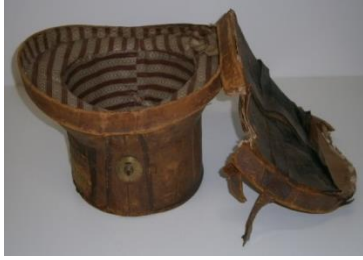
Man's leather hatbox with concave lid, straps & striped cloth lining , late 19 th or early 20 th century Sticker on hatbox: "checked baggage, Liverpool" Gift of the Drama Department Costume Shop, Dartmouth College

Reason: Space limitations in the costume collection.