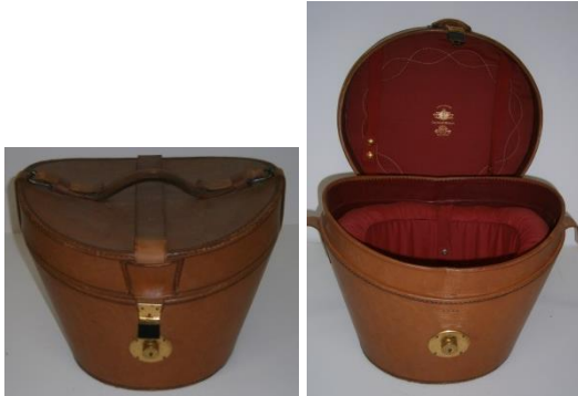
Man's leather hatbox with concave lid, straps, and red lining , late 19 th or early 20 th century "Collins & Fairbanks" Gift of the Drama Department Costume Shop, Dartmouth College

Reason: Space limitations in the costume collection.