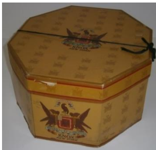
Man's gold hexagon-shaped cardboard hatbox , mid-20 th century "Knox New York" Gift of the Drama Department Costume Shop, Dartmouth College

Reason: Space limitations in the costume collection.