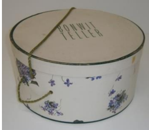
Woman's white & purple flowered cardboard hatbox , mid-20 th century "Bonwit Teller" Gift of the Drama Department Costume Shop, Dartmouth College

Reason: Space limitations in the costume collection.