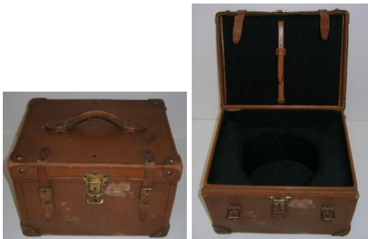
Man's rectangular leather hat box with straps , early 20 th century Gift of the Drama Department Costume Shop, Dartmouth College

Reason: Space limitations in the costume collection.