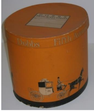
Man's orange cardboard hatbox , mid-20 th century "Dobbs Fifth Avenue" Gift of the Drama Department Costume Shop, Dartmouth College

Reason: Space limitations in the costume collection.