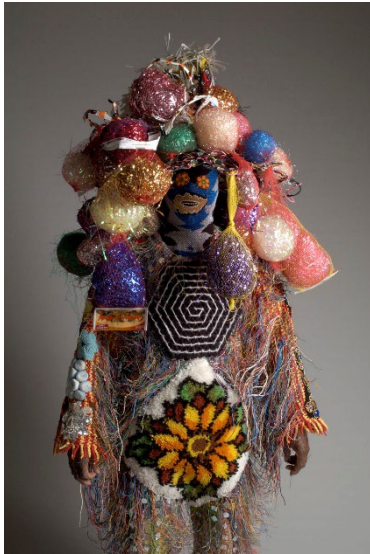
Image: Nick Cave, Soundsuit (NC.06.019), 2006, easter grass, mirrors, cotton, paint, appliqué. Hood Museum of Art, Dartmouth: Purchased through the Mrs. Harvey P. Hood W'18 Fund; 2022.53.