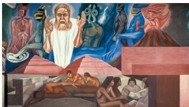
Image: José Clemente Orozco, The Epic of American Civilization: The Coming of Quetzalcoatl (Panel 5), 1932-34, fresco. Hood Museum of Art, Dartmouth: Commissioned by the Trustees of Dartmouth College; P.934.13.7.

The Hood Museum of Art has an evolving but distinguished collection of public art that is intended to enhance the environment in which the Dartmouth and surrounding communities study, work, and live. These outdoor installations are incorporated into the built and natural landscape, as public art has the potential to transform and activate the surrounding sites. The works are for all and can be accessed by all, so we welcome viewers to experience these public artworks in the hopes that they foster inquiry, contemplation, and community conversation.