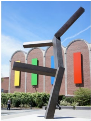
Image: View of Joel Shapiro's untitled (Hood Museum of Art) (1989-90) and Ellsworth Kelly's Dartmouth Panels (2012).

Laura Maes's Spikes is a site-specific installation that makes audible the sun's energy as it changes over time. As solar panels attached to the exterior of the building gather energy, they complete the more than 100 handmade circuits mounted on the ceiling.