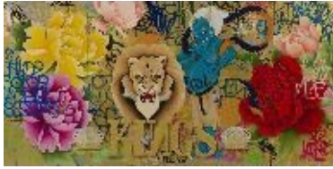
Image: Gajin Fujita, Invincible Kings of This Mad Mad World , 2017, spray paint, paint markers, Mean Streak, 24k gold leaf, 12k white gold leaf, platinum leaf, and gloss finish on panel; four parts, 96 x 48 in. each.