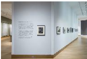
Image: Margaret Bourke-White, World War II, and Life Magazine installed at the Hood Museum of Art, Dartmouth.

Playing upon the dual definitions of liquidity—liquid assets bought and sold, as well as liquid substances—this exhibition mines the historical connections between art, water, and commodities. Highlights from the Hood Museum’s American painting, sculpture, and decorative arts collection explore histories of global trade across water; linkages between water and tourism; liquids as artistic materials; and how water pollution and historical access to clean water are relevant to local and national discussions in our present moment.