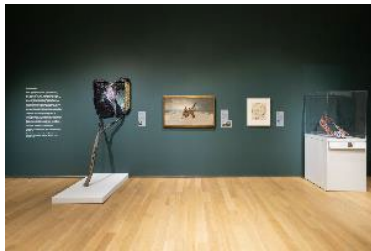
Image: Historical Imaginary installed at the Hood Museum of Art, Dartmouth.

For abstract painters such as Robert Motherwell, the action of creating a brushstroke itself has a singular importance. Often referred to as "gestural," these works track the movements of the artists' hand in the creation of imagery that favors invisible concerns such as emotion, spirituality, and the metaphysics of existence. Some of these artists seek to downplay all traces of their own gestures—Deborah Remington—while others utilize techniques that involve pouring, dripping, or splashing pigment onto their canvases—notably Helen Frankenthaler.