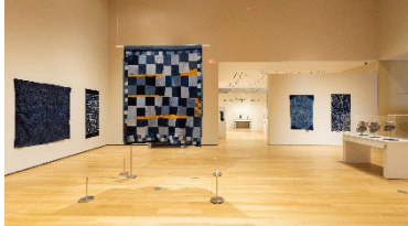
Image: Homecoming: Domesticity and Kinship in Global African Art installed at the Hood Museum of Art, Dartmouth.

Emphasizing the role of women artists and feminine aesthetics in crafting African and African diaspora art histories, this exhibition surveys themes of home, kinship, motherhood, femininity, and intimacy in both historic and contemporary works. Homecoming breaks free of the binary traditional/contemporary to instead dwell at the interstices of history, futurity, and spirituality over the past two centuries.