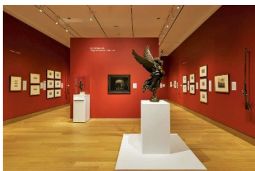
Image: Recording War: Images of Violence, 1500–1900 installed at the Hood Museum of Art, Dartmouth.

Featuring two newly commissioned paintings by Cree artist Kent Monkman , The Great Mystery serves as both an introduction to and a revisitation of Monkman's earliest abstract expressionist paintings from the 1990s and his reimagining of these works today. Drawing on the Hood Museum's collection of modernist abstraction, Monkman's new paintings are unlike anything we have seen from him before.