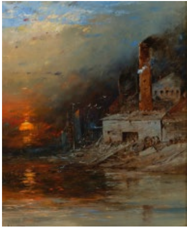
Image: William Louis Sonntag, Boat Yard on the East River , about 1870–74, oil on canvas. Hood Museum of Art, Dartmouth: Purchased through the Robert J. Strassenburgh II 1942 Fund; 2022.6.