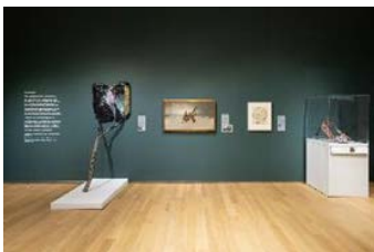
Image: Historical Imaginary installed at the Hood Museum of Art, Dartmouth.

The artists in Layered Histories deftly use color, pattern, and abstraction to create a sense of place that layers images of the land (known as Country) with creation stories, historical events, and significant animals, plants, and people. Unlike Western ideas of history, which often draw a firm line between events of the past and of the present, these Indigenous artists evoke more comprehensive