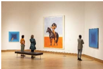
Image: Kent Monkman: The Great Mystery installed at the Hood Museum of Art, Dartmouth.

Emphasizing the role of women artists and feminine aesthetics in crafting African and African diaspora art histories, this exhibition surveys themes of home, kinship, motherhood, femininity, and intimacy in both historic and contemporary works. Homecoming breaks free of the binary traditional/contemporary to instead dwell at the interstices of history, futurity, and spirituality over the past two centuries.