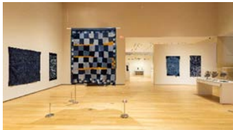
Image: Homecoming: Domesticity and Kinship in Global African Art installed at the Hood Museum of Art, Dartmouth.