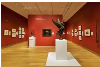
Image: Recording War: Images of Violence, 1500–1900 installed at the Hood Museum of Art, Dartmouth.

Featuring two newly commissioned paintings by Cree artist Kent Monkman , The Great Mystery serves as both an introduction to and a revisitation of Monkman’s earliest abstract expressionist paintings from the 1990s and his reimagining of these works today. Drawing on the Hood Museum’s collection of modernist abstraction, Monkman’s new paintings are unlike anything we have seen from him before.