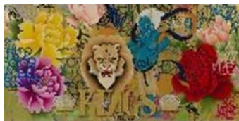
Image: Gajin Fujita, Invincible Kings of This Mad Mad World , 2017, spray paint, paint markers, Mean Streak, 24k gold leaf, 12k white gold leaf, platinum leaf, and gloss finish on panel; four parts, 96 x 48 in. each. Courtesy of the artist and L.A. Louver, Venice, California. © Gajin Fujita, photo courtesy of the artist and L.A. Louver, Venice, California