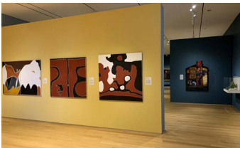
Image: Layered Histories: Indigenous Australian Art from the Kimberley and Central Desert installed by the Hood Museum of Art, Dartmouth.