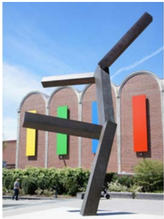
Image: View of Joel Shapiro's untitled (Hood Museum of Art) (1989-90) and Ellsworth Kelly's Dartmouth Panels (2012).

Laura Maes's Spikes is a site-specific installation that makes audible the sun's energy as it changes over time. As solar panels attached to the exterior of the building gather energy, they complete the more than 100 handmade circuits mounted on the ceiling.