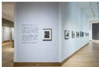
Image: Margaret Bourke-White, World War II, and Life Magazine installed at the Hood Museum of Art, Dartmouth.

Playing upon the dual definitions of liquidity—liquid assets bought and sold, as well as liquid substances—this exhibition mines the historical connections between art, water, and commodities. Highlights from the Hood Museum’s American painting, sculpture, and decorative arts collection explore histories of global trade across water; linkages between water and tourism; liquids as artistic materials; and how water pollution and historical access to clean water are relevant to local and national discussions in our present moment.