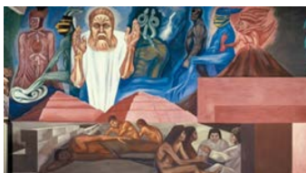
Image: José Clemente Orozco, The Epic of American Civilization: The Coming of Quetzalcoatl (Panel 5), 1932–34, fresco. Hood Museum of Art, Dartmouth: Commissioned by the Trustees of Dartmouth College; P.934.13.7.

The Hood Museum of Art has an evolving but distinguished collection of public art that is intended to enhance the environment in which the Dartmouth and surrounding communities study, work, and live. These outdoor installations are incorporated into the built and natural landscape, as public art has the potential to transform and activate the surrounding sites. The works are for all and can be accessed by all, so we welcome viewers to experience these public artworks in the hopes that they foster inquiry, contemplation, and community conversation.