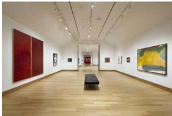
Image: The Painter's Hand: U.S. Abstraction since 1950 installed at the Hood Museum of Art, Dartmouth.