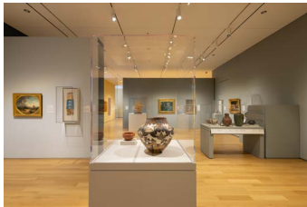
Image: Liquidity: Art, Commodities, and Water installed at the Hood Museum of Art, Dartmouth.