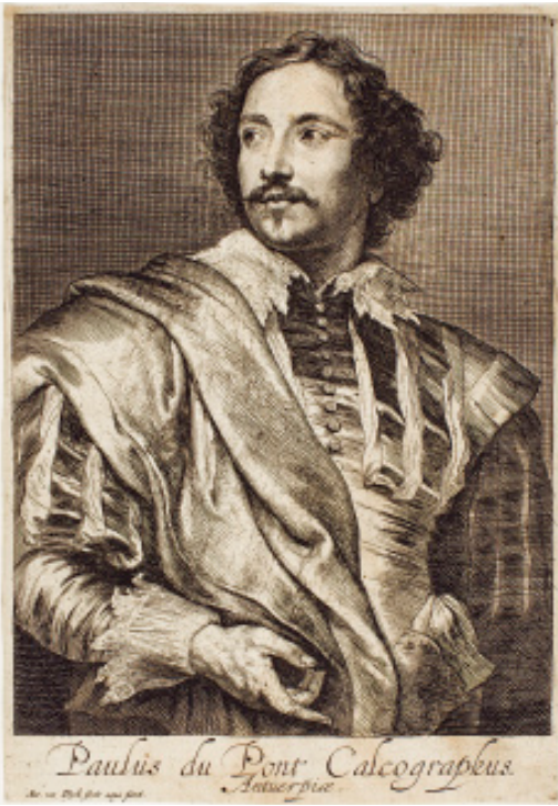
FIG. 4. Anthony van Dyck, Paulus Ponitus , about 1630; reprinted in the second half of the 17th century, etching and engraving. Purchased through the Adelbert Ames Jr. 1919 Fund; 2009.62

of Van Dyck's etched portrait, the background was filled with a network of thin, intersecting lines, which contrasted with a pattern of hatching and dots to delineate the features of the figure. The effects of light and shade were rendered by varying the density of the markings, similar to the process of drawing with a pen. However, while Van Dyck succeeded in conveying the character of the sitter (part of an ambitious printmaking project to create a uniform series of famous contemporaries derived from his portraits), the print failed to convincingly reproduce the atmosphere and darkness of the painting. Nearly a century and a half later, Watson recognized the potential of mezzotint to better capture the complete tonality and drama of Van Dyck's picture. He started with a copper plate, the entire surface of which had already been abraded with a tiny mesh of indentations by a serrated tool called a rocker. If printed at that stage, the dots in the plate would have deposited an even, velvety layer of ink on the paper. The next step in the process required the burnishing, or smoothing out, of the areas intended to appear graded or white, removing the indentations so that little or no ink would be transferred to the paper. The shaded sections were left alone. Watson's portrait print demonstrated the affinity of the mezzotint