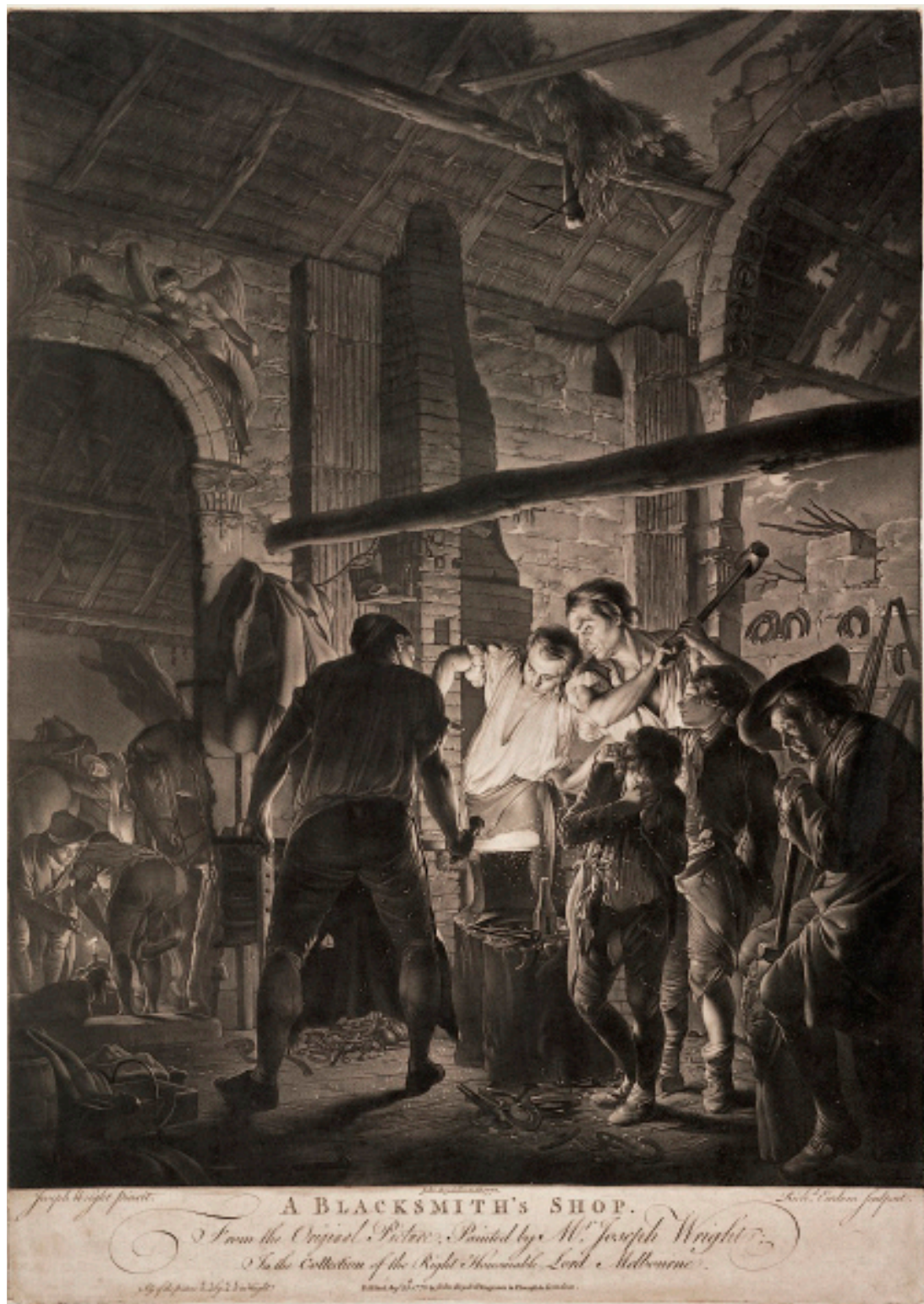
FIG. 8. Richard Earlom after Joseph Wright of Derby, A Blacksmith's Shop , 1771, mezzotint. Purchased through the Julia L. Whittier Fund; PR.952.66.