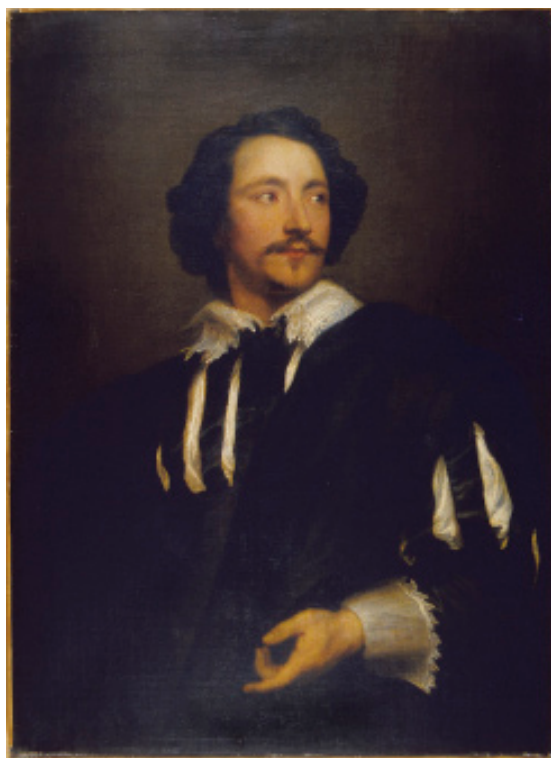
Fig. 3. Anthony van Dyck, Paulus Pontius , about 1630, oil on canvas, 35 \frac{7}{8} x 25 \frac{3}{4} in. Jerusalem, Israel Museum.

The traditional intaglio printmaking methods such as etching and engraving, in which the ink is deposited into the recessions of a metal plate, employ a system of lines to indicate tonal transitions from light to dark. In the case