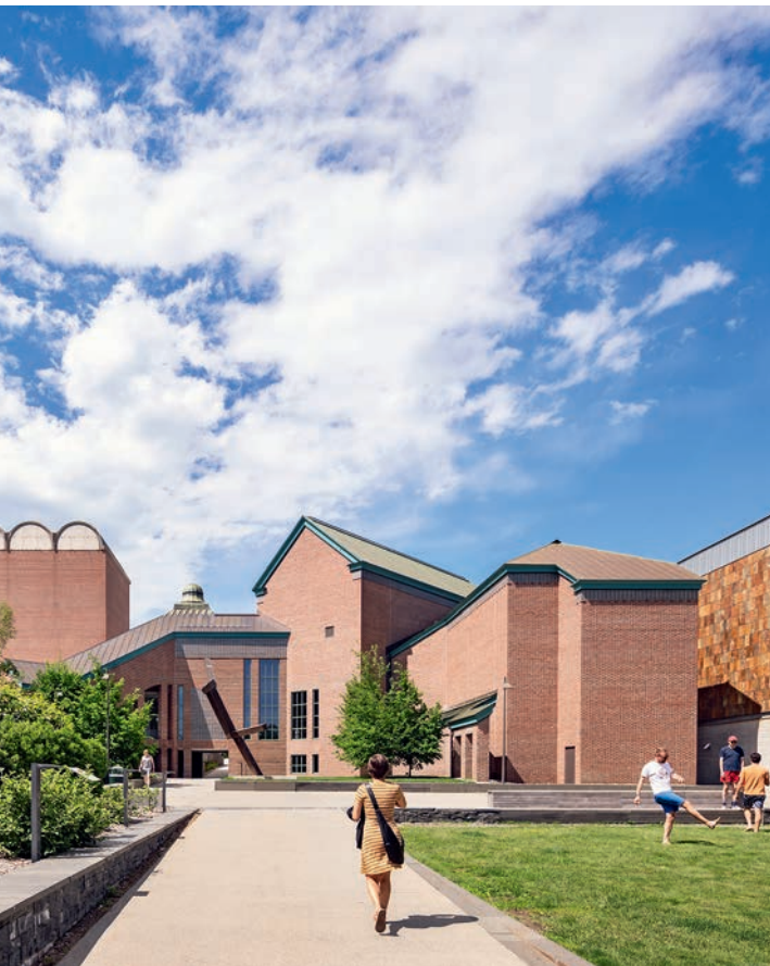
The south façade.

As you may notice, we have a variety of “voices” present in the museum. In addition to our own staff, we have invited students, faculty, and visiting curators and scholars to ask questions and share their interpretations of works on view. By presenting multiple vantage points, we hope to create space for you to activate your own connections to the art and ideas that are shared here.