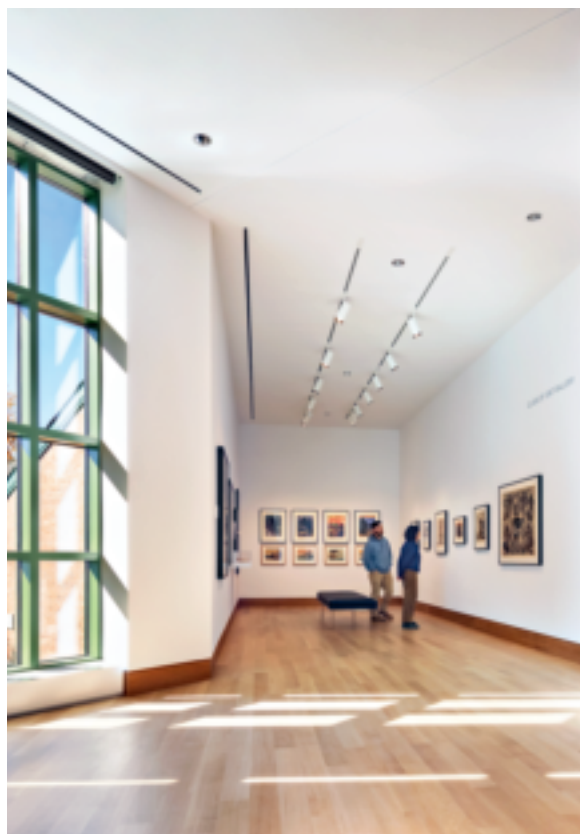
Class of 1967 Gallery.

Along with object labels, each gallery offers special labels on the themes of object biography, society and culture, materiality, and objects in dialogue. We hope you find these installations both engaging and inspiring.