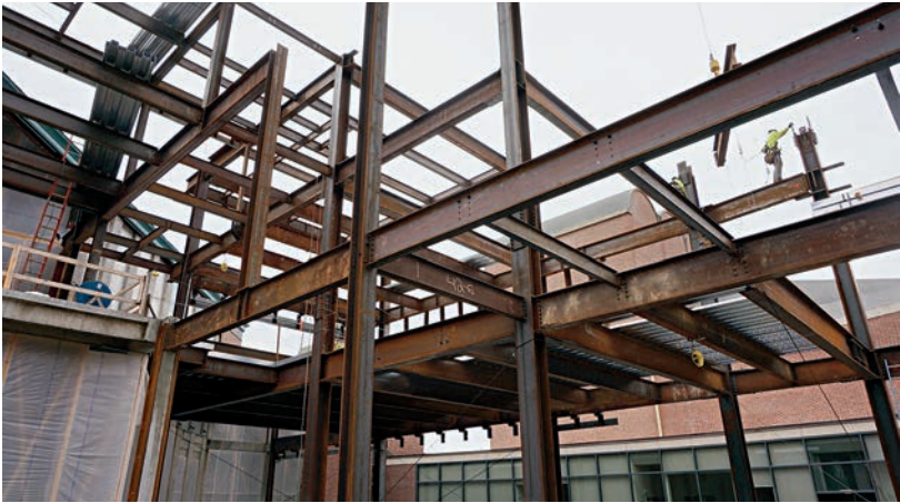
April 7, 2017 | Progress made over the course of three weeks.

One year after our galleries closed to the public, steel beams started going up. These images document the progress made over the course of five weeks in early spring 2017.