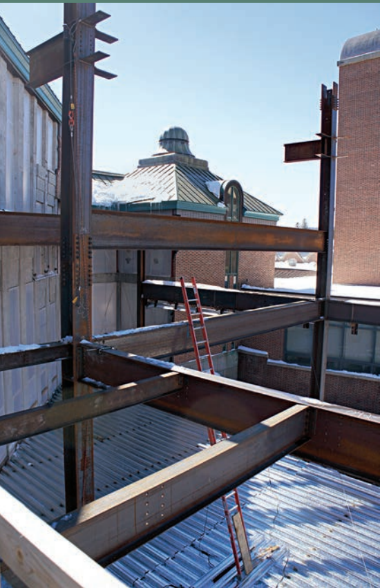
March 17, 2017 | The first steel beams for the Hood's expansion are in place.

A behind-the-scenes look at the museum's expansion.