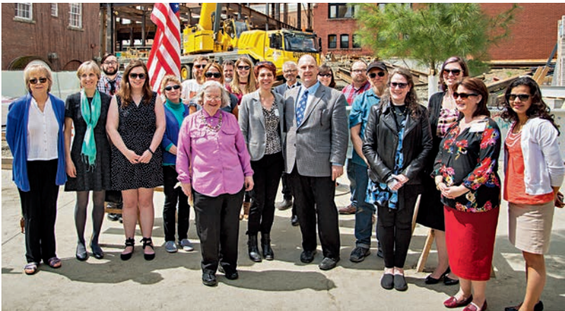
Museum staff at the topping-out ceremony. Photo by Mark Washburn.

At the topping-out ceremony, all involved signed the ceremonial beam. Photo by Mark Washburn.