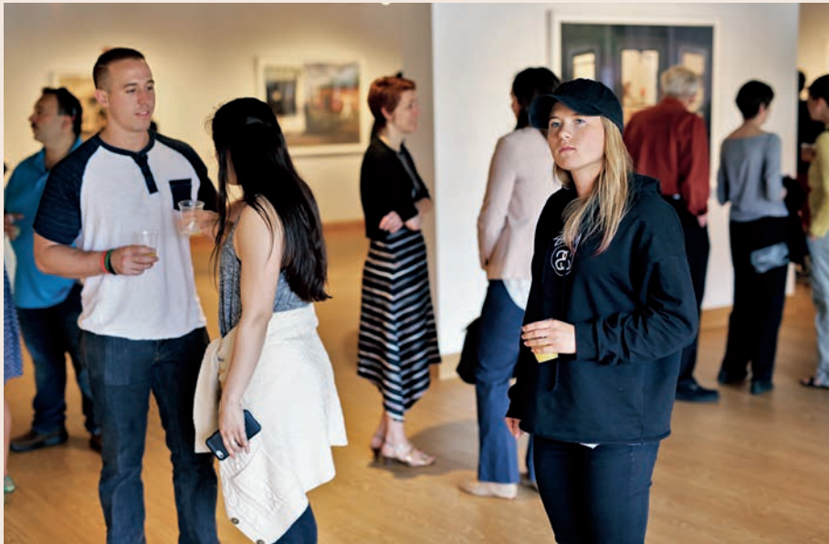
Dartmouth students in Hood Downtown at the annual Mimosas at the Museum event for graduating seniors and their families.