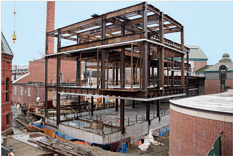
April 21, 2017 | Part of the museum's façade, seen from the front deck of the Hopkins Center for the Arts.