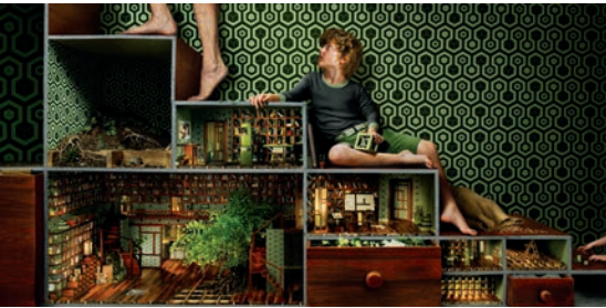
Laetitia Soulier, The Square Roots 3 , from the series titled The Fractal Architectures , 2014, C-print.