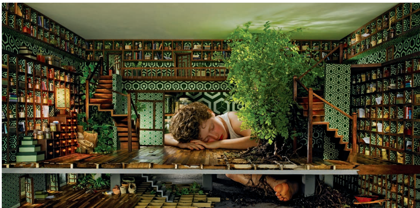
Laetitia Soulier, The Square Roots 2 , from the series titled The Fractal Architectures , 2014, C-print.