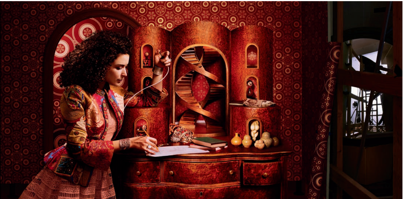
Laetitia Soulier, Self-Portrait , from the series titled The Fractal Architectures , 2016, C-print.

This article is adapted from an essay in the exhibition's accompanying brochure.