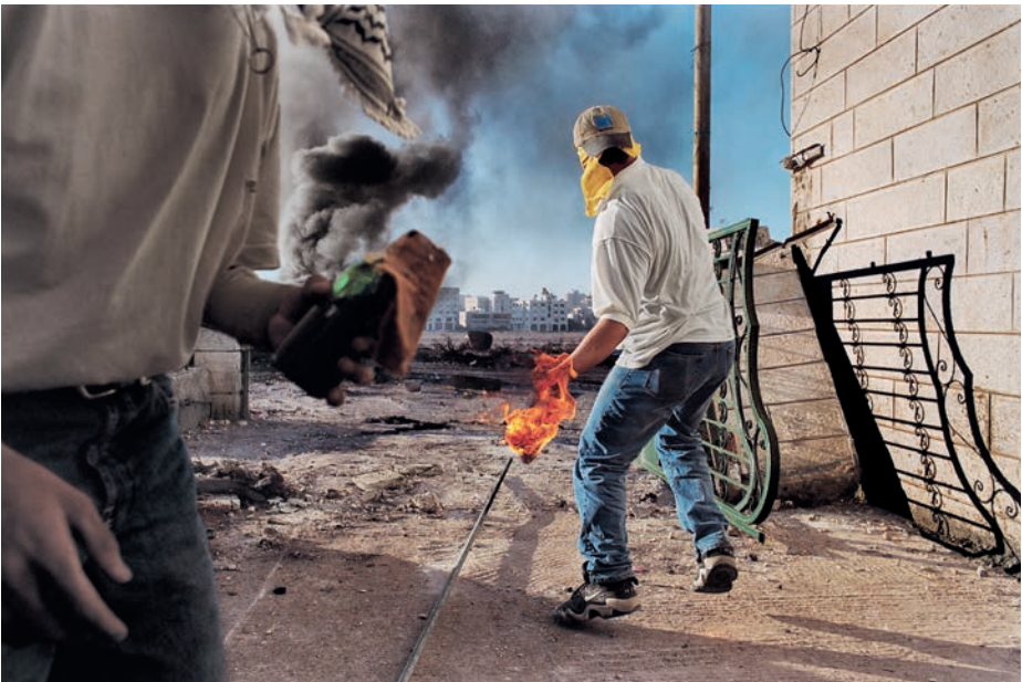
Mostar, Bosnia-Herzegovina, 1993. During the civil war in Yugoslavia, the city of Mostar became the scene of a bitter conflict between ethnic Croats and Bosnians. The fighting took place at close quarters—from house to house, room to room, neighbor against neighbor.

Eugene Smith Memorial Grant in Humanistic Photography, as well as lifetime achievement awards from the Overseas Press Club, the American Society of Magazine Editors, and Time, Inc. In 2012, he was awarded the Dresden Prize, given annually to those who go above and beyond to prevent violence. This year Nachtwey received the Princess of Asturias Award. ■