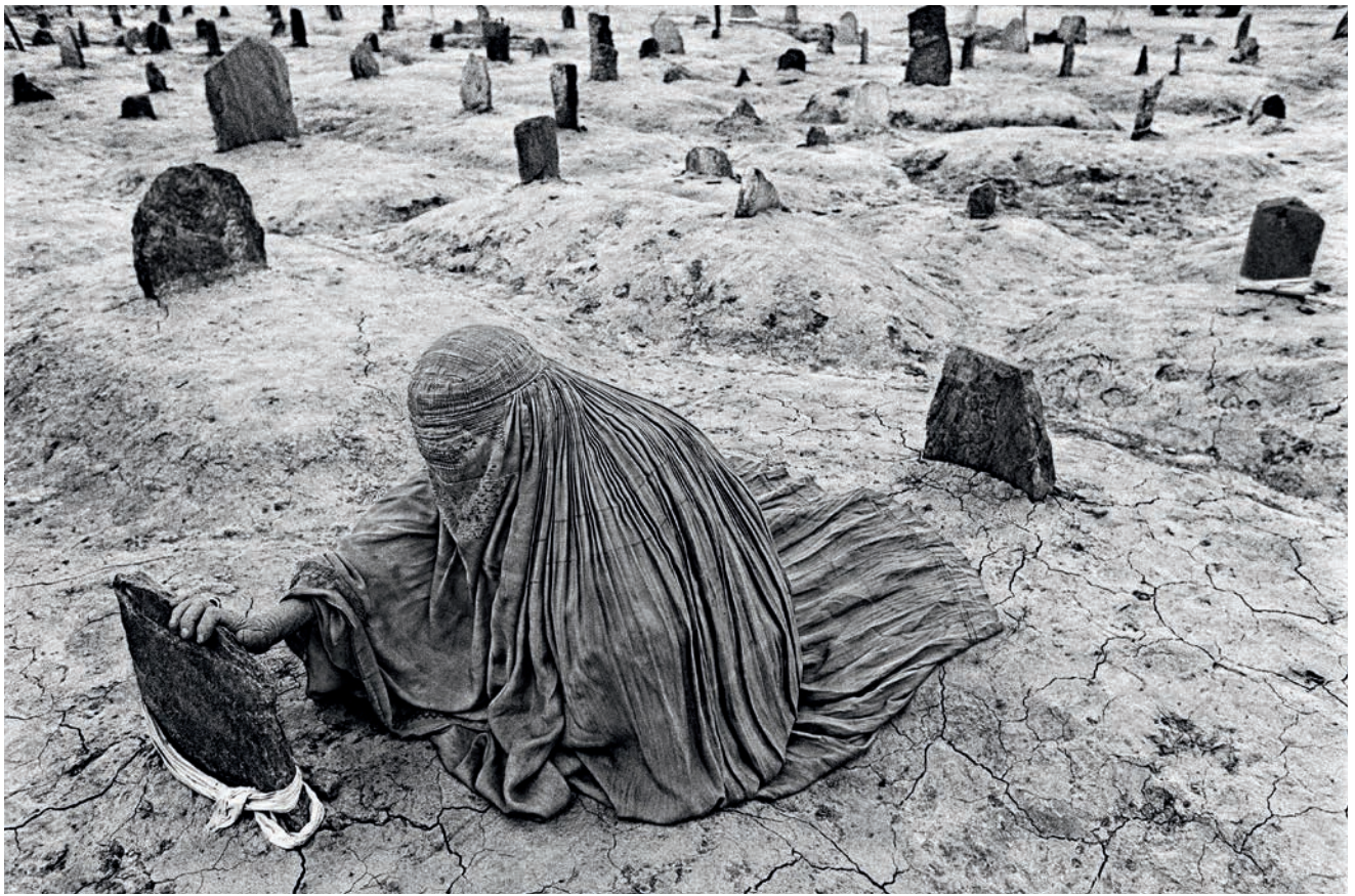
Kabul, Afghanistan, 1996. A woman dressed in a traditional burka mourns for her brother, who was killed in a Taliban rocket attack during the siege of Kabul.

Nachtwey has been a contract photographer with Time magazine since 1984. He was associated with Black Star from 1980 to 1985 and was a member of Magnum from 1986 to 2001. He has had solo exhibitions at numerous museums and galleries, including the International Center of Photography in New York, Bibliothèque nationale de France in Paris, Palazzo delle Esposizioni in Rome, the Museum of Photographic Arts in San Diego, El Circulo de Bellas Artes in Madrid, Culturgest in Lisbon, FOAM in Amsterdam, Carolinum in Prague, and Hasselblad Center in Sweden, among others. He is also the subject of the Oscar-nominated documentary feature film War Photographer , which was directed by Christian Frei and released to critical acclaim in 2001.