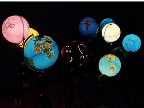
Ingo Günther, installation of the World Processor series, illuminated globes. © Ingo Günther