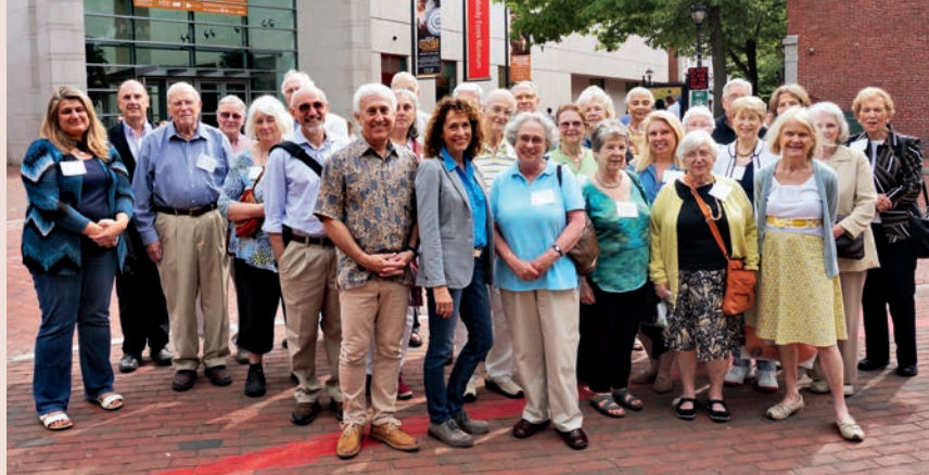
Members and non-members recently traveled to the Peabody Essex Museum in June 2016 on a museum day trip.