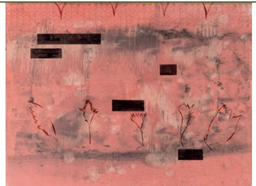
Bahar Behbahani, The Decisions are Made: Activity Begins , 2015–16, mixed media on canvas. © Bahar Behbahani

Works in the exhibition are also personal and cathartic. They enable Behbahani to resolve her conflicted emotions and make peace with the late Donald Wilber, a scholar of Persian architecture and gardens who was also a CIA secret agent. Wilber was the purported mastermind of a 1953 military coup in Iran that ousted democratically elected, beloved, and pro-national prime minister Mohammad Mosaddegh. This singular mid-century event reshaped Iran's modern history and continues to impact the present. Behbahani's compelling visual language in this series draws upon the schematic architectural plans, ritual geometry, and the ornate aesthetics of the gardens, as well as the poetry they evoke, to convey rich and complex narratives.