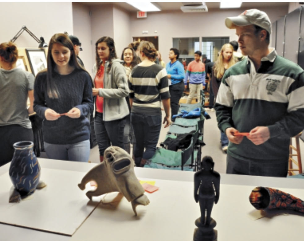
Religion 1, Patterns of Religious Experience.