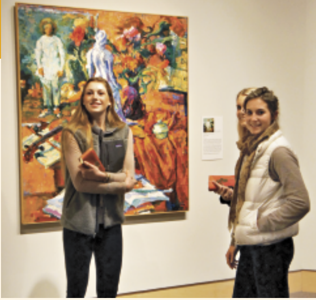
Enjoying the opening party for In Residence on January 24, 2014.