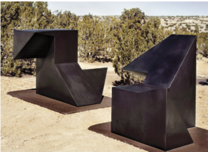
Allan Houser, Options , 1992, bronze edition of 6. © Chiinde LLC, exhibition loan courtesy of Allan Houser, Inc.

It is a lesser-known fact that Houser had great facility as a draftsman. He experimented with ideas for sculptural works in his sketchbooks, as will be clear from the drawings that will be on view in the fall. One such drawing (see image) demonstrates his expressive range—the biomorphic sculpture at the top right reveals his engagement with modernism and is directly reflected in the sculpture Watercarrier (1986), which will be on display this spring. Houser