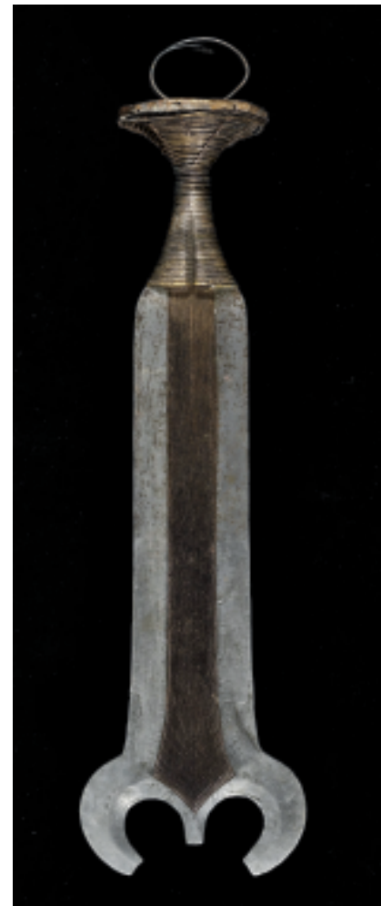
(above) Unknown artist, Teke peoples, Ngala peoples, Democratic Republic of Congo, Central Africa, executioner's sword, metal. Museum purchase; 39.64.6954.

This exhibition was organized by the Hood Museum of Art, Dartmouth College, and was generously supported by the William B. Jaffe and Evelyn A. Hall Fund.