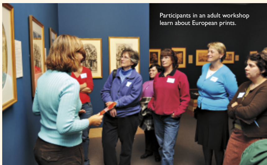
Participants in an adult workshop learn about European prints.