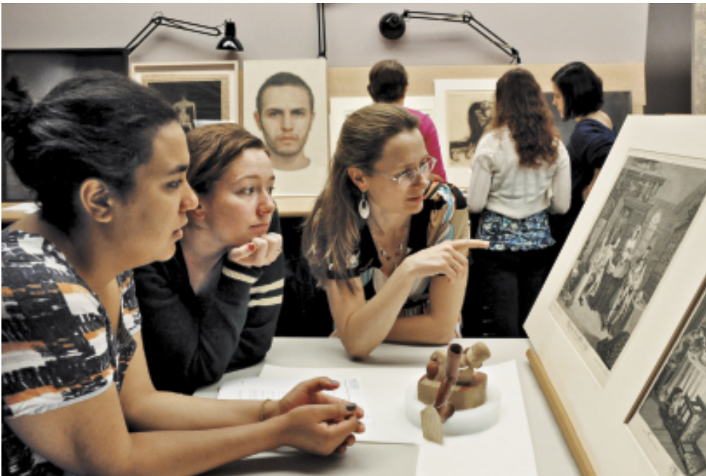
Anthropology 50, College Course 2, HIV/AIDS through a Biosocial Lens.

There is no pedagogical moment more personal and indelible than when a student discovers an abstract idea, an emotion, or