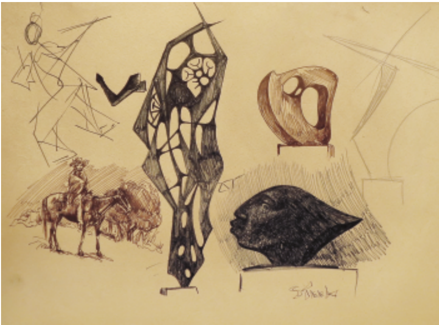
Allan Houser, Three Non-Objective Forms, Abstracted Face, Horse and Rider, Ga'an Dancer, undated, felt-tip pen, pencil.

also created many images inspired by Native American and Southwestern life, and his skill, coupled with the joy he took in working through his ideas on paper, is abundantly apparent.