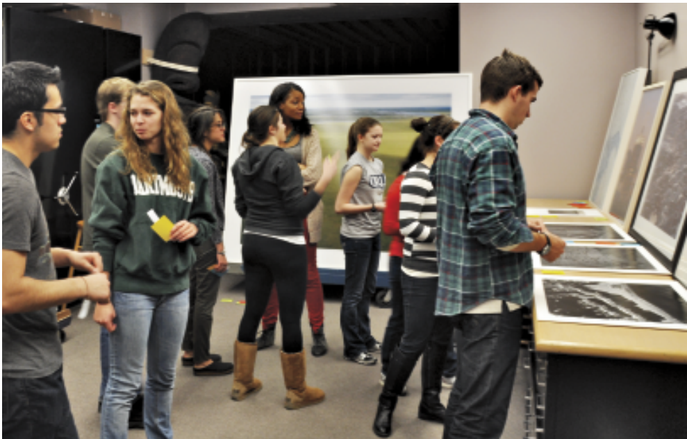
Geography 11, Qualitative Methods and the Research Process in Geography.

an historical narrative made palpable in the unique work of an artist’s creative vision. This is why the Hood is one of my most valued teaching tools.