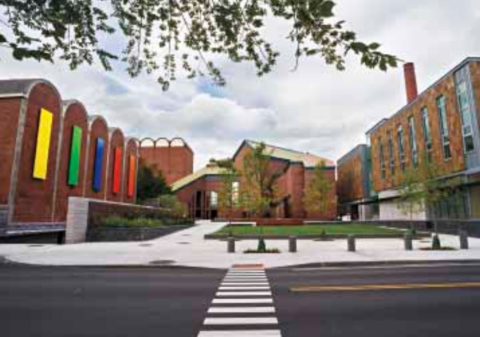
Dartmouth's new Arts District comprised of (from left) the Hopkins Center for the Arts, the Hood Museum of Art, and the Black Family Visual Arts Center.

members of a significant artistic generation that emerged in mid-1950s New York. Unlike his contemporaries Jasper Johns, Robert Rauschenberg, and Roy Lichtenstein, who incorporated recognizable subject matter into their work, Kelly committed his art to the realization of an abstract language, though one still informed by everyday visual experience, such as the shadow of a metal staircase or the shape of a woman's scarf. He also sought to accommodate the real world in his art, emphasizing the architectural wall on which his work would be hung. As Kelly explained in 1983, "The result was a painting whose interest was not only in itself, but also in its relation to things outside it."