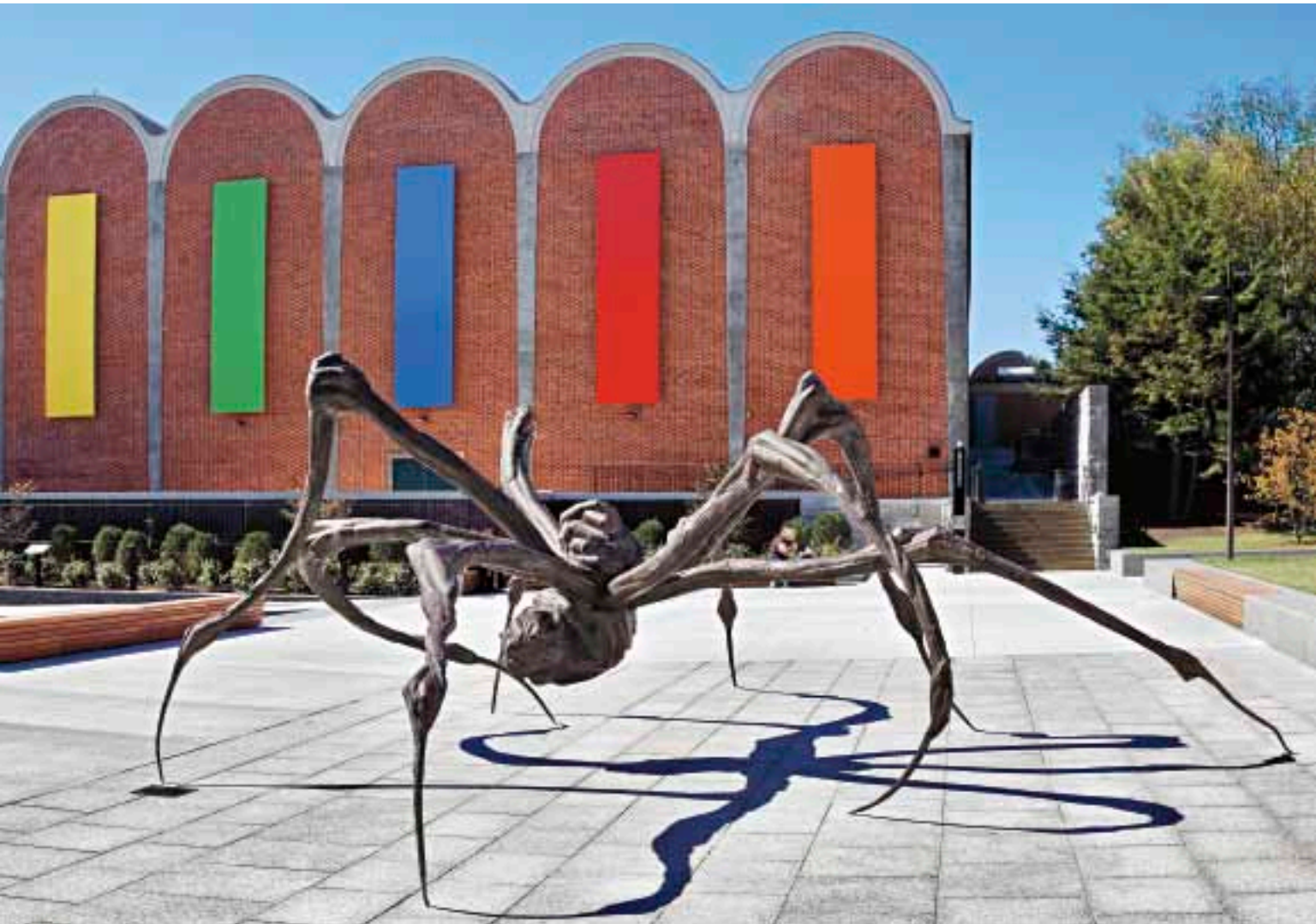
Louise Bourgeois's Crouching Spider and Ellsworth Kelly's Dartmouth Panels on the Maffei Arts Plaza.

The Hood Museum of Art is a teaching museum. Our mission is to create an ideal learning environment that fosters transformative encounters with works of art.