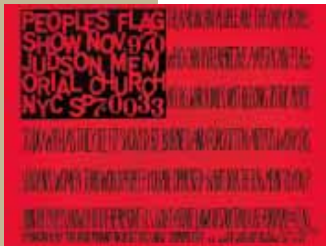
Faith Ringgold, People's Flag Show , 1970, offset lithograph. Purchased through the Mrs. Harvey P. Hood W'18 Fund; 2012.16. © Faith Ringgold 1970.

United States of Attica represents Ringgold’s tribute to the thirty-nine people who died in the police raid on Attica Correctional Facility in New York on September 13, 1971. Approximately one thousand prisoners protested the horrific living conditions at Attica by taking control of the prison and holding thirty-three staff members hostage. During four days of negotiations, authorities agreed to twenty-eight of the prisoners’ demands, but would not agree to a complete amnesty from criminal prosecution for the prison takeover. On the order of Governor Nelson Rockefeller, state police took back control of the prison by force, resulting in the bloodiest one-day encounter between Americans since the Civil War. In response to the Attica massacre, Ringgold diligently researched incidents of genocide and murder throughout American history and recorded them on a map of the United States. Indeed, the poster invites others to contribute further documentations of brutalities committed under the auspices of the United States government or from the time the colonies