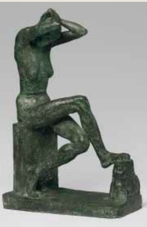
Jacob Epstein, Nan Seated , 1911, bronze. Gift of Josephine Patterson Albright, Class of 1978 HW; S.984.47

Most museum installations present works of art that reflect the achievements of a particular culture, a defined period of time, or a specific theme. In The Beauty of Bronze , an array of disparate objects produced over the course of more than a thousand years in a single medium highlight a range of utilitarian forms and artistic designs produced either as multiple casts or as unique pieces. These sculptures showcase the universal allure of bronze for daily use, for devotional purposes, or for purely aesthetic appeal.