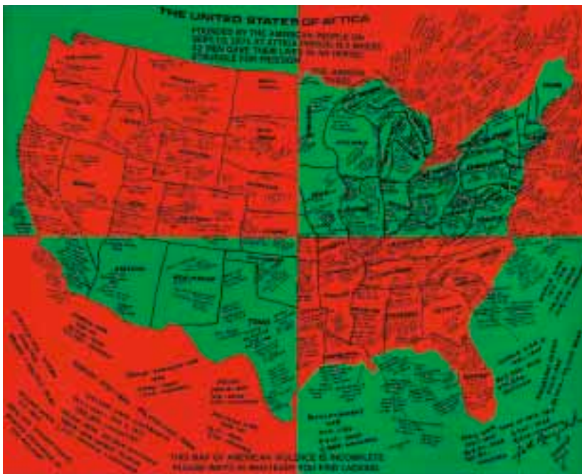
Faith Ringgold, United States of Attica , 1971–72, offset lithograph. Gift of the artist and ACA Galleries, New York; 2012.23. © Faith Ringgold 1971