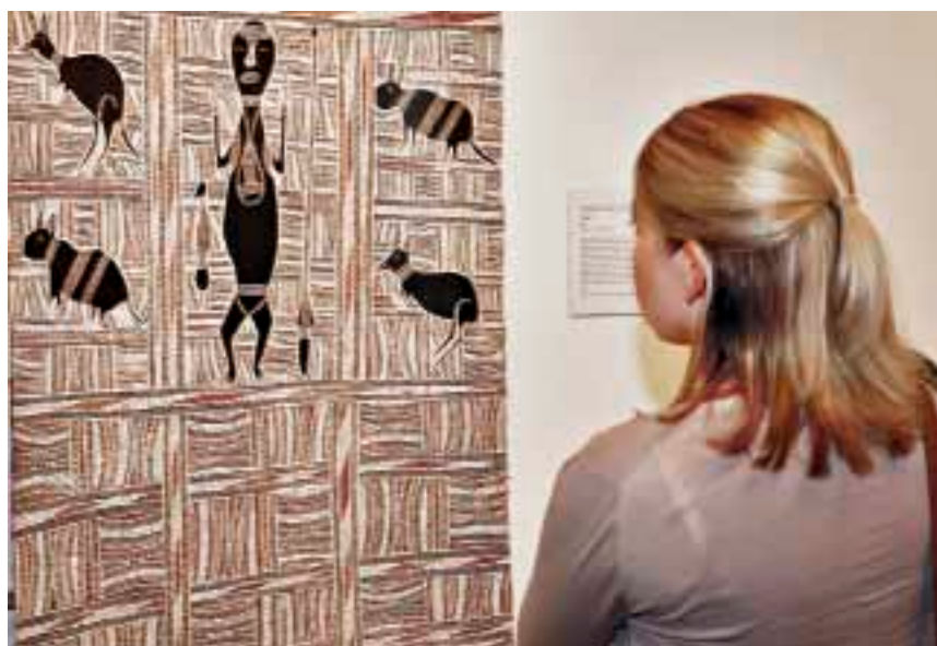
(top) Crossing Cultures gallery.

(above) A visitor examines Wolpa (Daisy) Wanambi, Wuyal , 2005, ochres on stringy bark. Gift of Will Owen and Harvey Wagner; 2009.92.332.