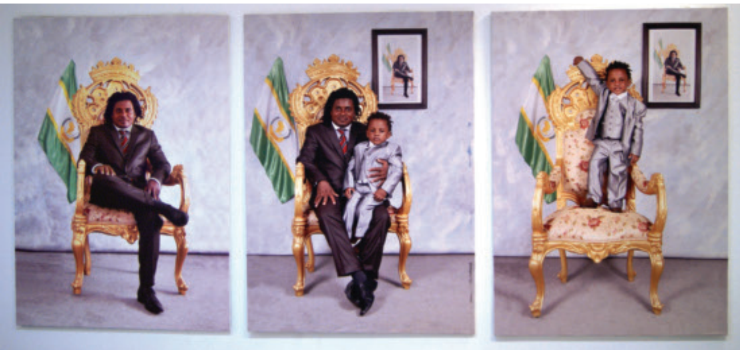
Hervé Youmbi, Au nom du père , 2011, photograph (triptych on canvas), Dak'Art 2012.