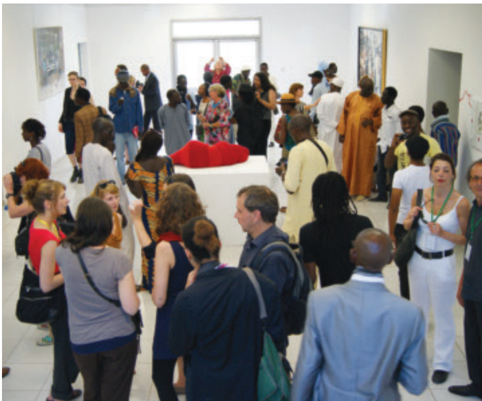
Dak'Art 2012 Official Exhibition, IFAN Museum, Dakar, 9 May 2012.