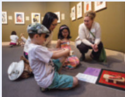
Parents and children learn about Japanese woodblock prints and culture together during a family workshop.