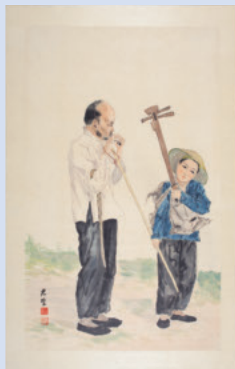
Fan Tchunpi, Blind Beggar with Child , 1936, watercolor and sumi ink over pencil on thin off-white Chinese paper.