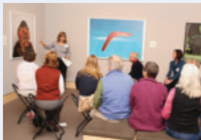
Participants in an adult workshop learn about contemporary Aboriginal Australian art.

We invite you to come to the museum often, participate in the programs offered, and see if your thoughts and feelings about different types of art change over time. If they do, we hope you will let us know by emailing hood.museum@dartmouth.edu .