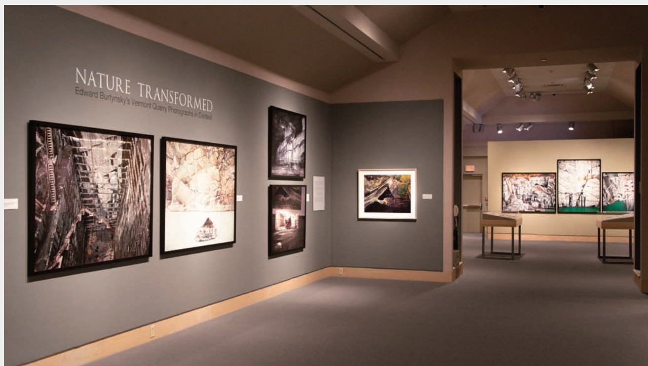
Nature Transformed: Edward Burtynsky's Vermont Quarry Photographs in Context.