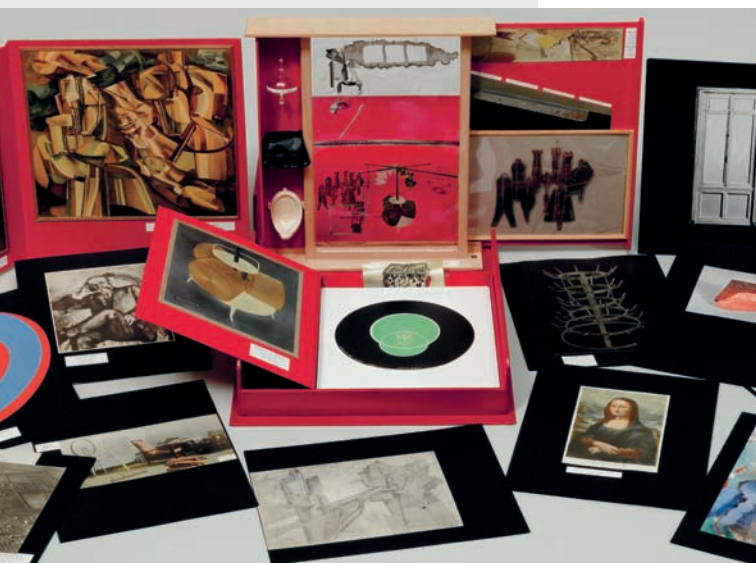
Marcel Duchamp, Box in a Valise ( Boîte-en-valise, Series F) (detail), 1966, mixed-media assemblage: red leather box containing miniature replicas, photographs, and color reproductions of eighty works by Marcel Duchamp. Purchased through the Mrs. Harvey P. Hood W'18 Fund, the Florence and Lansing Porter Moore 1937 Fund, the Miriam and Sidney Stoneman Acquisitions Fund, and the William S. Rubin Fund; 2011.49.

Non-Profit Org. US Postage PAID Dartmouth College