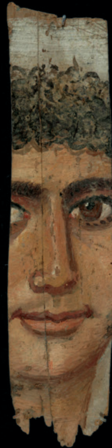
Roman, Egyptian, portrait of a youth, 2nd century CE, encaustic on wood. Yale University Art Gallery: Gift of the Associates in Fine Arts; 1939.263