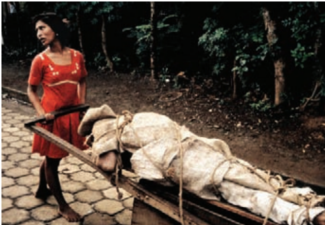
Monimbo woman carrying her dead husband home to be buried in their backyard, near Managua, Nicaragua, 1979, chromogenic print. Collection of the artist.