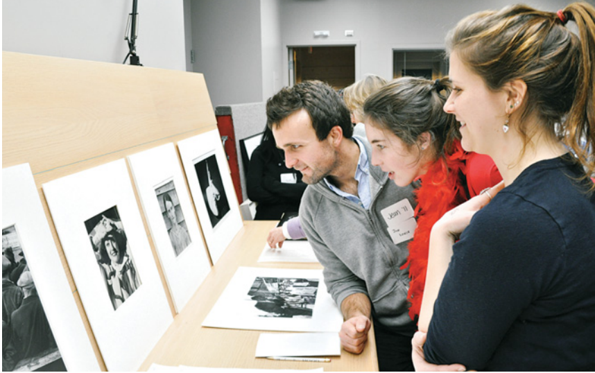
Dartmouth students view photographs in the museum's collection in the Bernstein Study-Storage Center.