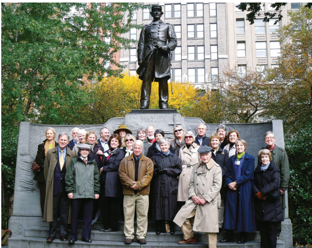
In front of the Farragut Monument in Madison Square Park during the joint member trip to New York between Saint-Gaudens and the Hood Museum of Art.

The first Art in Bloom benefit event was held in October and welcomed more than 150 ticketed