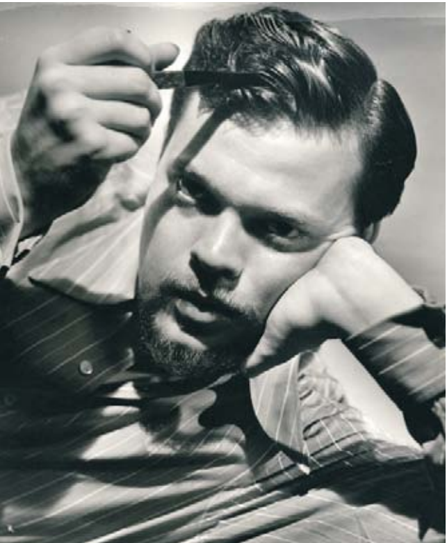
(opposite page, above) Gene Kornman, Rita Cansino (subsequently Hayworth) , 1939, silver print. (opposite page, below) Robert Coburn, Rita Hayworth for Gilda , 1946, silver print. (top) John Miehle, Fred Astaire and Ginger Rogers for Swing Time , 1936, platinum print from the original negative. (above) Ernest A. Bachrach, Orson Wells , 1940, silver print.