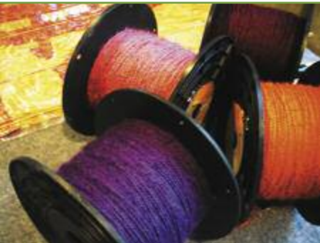
Colorful hair braid spools in Wenda Gu's Shanghai studio for his monumental installation in Baker-Berry Library.

WENDA GU: the green house Site-Specific Installation in Baker Library's Main Hall June 6–October 28, 2007