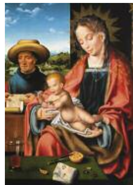
Joos van Clove, The Holy Family , c. 1520, oil on panel. Currier Museum of Art: Museum Purchase, Currier Funds; 1956.5.