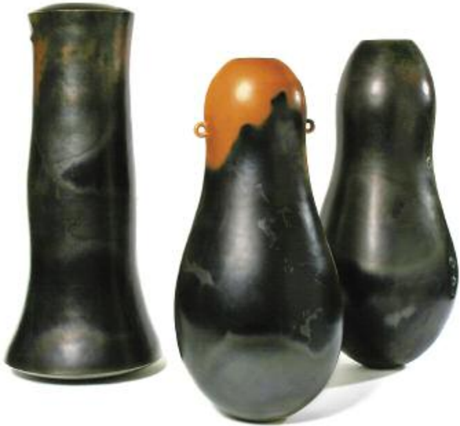
Magdalene Odundo, Vessel Series III, no. 1 (left), Vessel Series III, no. 3 (center), Vessel Series III, no. 4 (right), 2005–6, red clay, carbonized and multi-fired. Artist Collection, Courtesy of Anthony Slayter-Ralph.

Odundo’s vessels suggest both animated and vocal beings rooted equally in cross-cultural techniques and forms and in modern and postmodern sculptural sensibilities. Beyond its aesthetic resonance with multiple artistic traditions, her work reflects a unique insight into the transcultural roles and meanings of ceramic vessels, both sacred and secular. Resonance and Inspiration features her most recent body of work, supplemented by preparatory drawings.