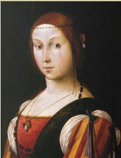
Lorenzo Costa, Portrait of a Lady , about 1506–10, oil on canvas. Currier Museum of Art: Museum Purchase, Currier Funds; 1947.4.