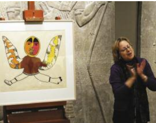
(top) Friends looking for clues in the galleries as part of the fundraiser Thin Ice: An Arctic Adventure .