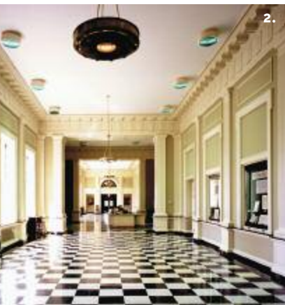
Fig. 1. Baker Library, Dartmouth College.