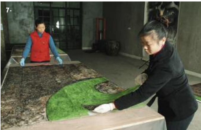
Figs. 7–8. Preparing hair panels and braid for the green house , Wenda Gu's studio, Shanghai, February 2007.