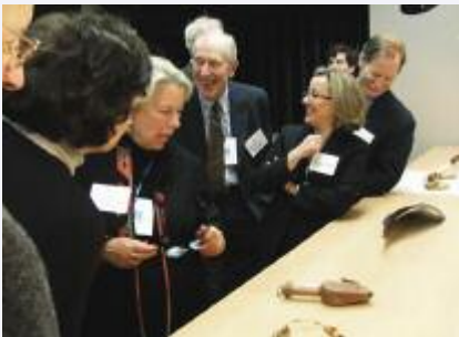
Members of the Friends admire art objects in the Bernstein Study-Storage Center.