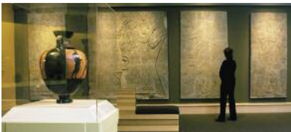
Looking, seeing, describing, interpreting, teaching—views in the upper and lower galleries of the Hood Museum of Art, 2007.