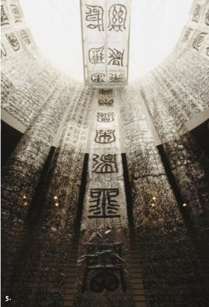
Fig. 5. Wenda Gu, united nations—babble of the millennium , 1999, human hair screen tower with pseudo-Chinese, English, Hindi, and Arabic languages. Permanent collection of San Francisco Museum of Modern Art.