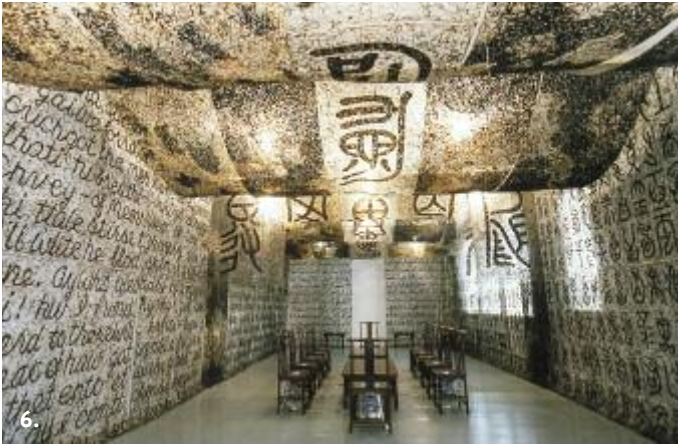
Fig. 6. Wenda Gu, united nations—china monument: temple of heaven , 1998, human hair from all over the world, pseudo-English, Chinese, Hindi, and Arabic, twelve Ming-style TV chairs, two Ming-style tables. Permanent collection of Hong Kong Museum of Art, China.