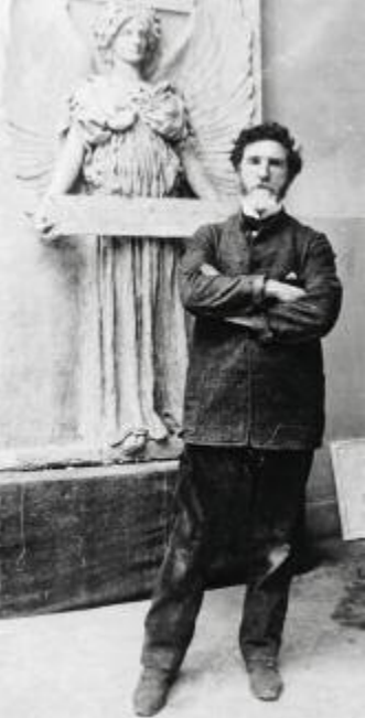
Augustus Saint-Gaudens in Paris, 1898.