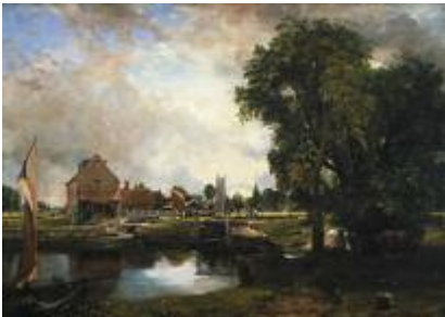
John Constable, Dedham Lock and Mill , 1820, oil on canvas. Currier Museum of Art: Museum Purchase, Currier Funds; 1949.8.