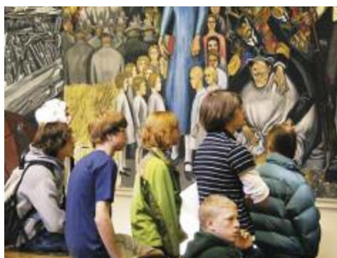
Area high school students study Orozco's murals in Baker Library.

The Hood and the Dartmouth College Library have introduced new interpretive tools to enhance visitors' experiences with José Clemente Orozco's The Epic of American Civilization (1932–34), arguably the most important mural cycle in the United States. Located in the Reserve Corridor of the College's Baker Library and maintained by the Hood, the murals provide students with the extraordinary opportunity to live with a monumental work of art, designed for and located in a prominent study area in the heart of campus. In addition, the work is frequented by thousands of tourists, school children, and scholars from around the world each year. Starting this summer, we are offering an illustrated brochure about the murals and their commission. A pre-recorded audio tour also will be available for download from the Hood's or the library's Web sites and preloaded on iPods at the reserve reading desk for use free of charge.