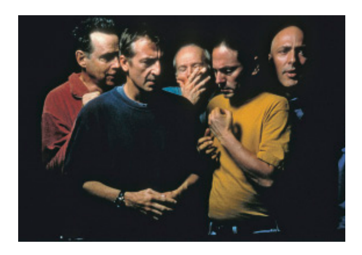
Bill Viola, The Quintet of the Silent , 2000, single-channel video on wall-mounted plasma screen. Purchased through gifts from the Lathrop Fellows: MIS.2002.7

The representation of emotion and spirituality in art has interested painters and scholars alike at least from the time of Socrates, but it took a particular turn in the Renaissance, when artists began to display a new confidence in their ability to express these qualities. From the fifteenth to the late eighteenth centuries, European artists developed a visual rhetoric of spirituality that appears at once ambitious and archaic to today's audiences. There has, however, been a modern resurgence of interest in the art of spirituality and emotion that looks directly to these Old Master works for inspiration. Artists such as the early-twentieth-century painter Wassily Kandinsky and, more recently, contemporary videographer Bill Viola have appropriated the rhetoric of Renaissance modes of expression for their own visualizations of spirituality, creating a dialogue across the centuries about our ability to comprehend and empathize with our fellow human beings through purely visual means.