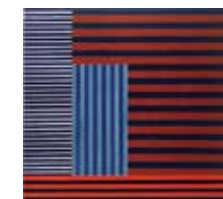
Come and Go, 1981

Try exploring this idea of a painting as a dramatic production, complete with characters, setting, dialogue, mood, and personal meaning. You can choose any work, but Come and Go offers especially rich dramatic possibilities, given its title.